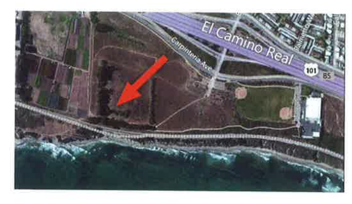
Seep location aerial view 2012

For a number of years, a small area of oil seepage was noticed near the former Kittie Bailard oil lease. In December of 2011, ConocoPhillips was contacted by the Department of Oil, Gas and Geothermal Resources (DOGGR). DOGGR is the State agency with oversight of oil field operations. While it is not known whether the seep was naturally occurring or related to past operations at the wellhead, ConocoPhillips moved quickly to address the problem.